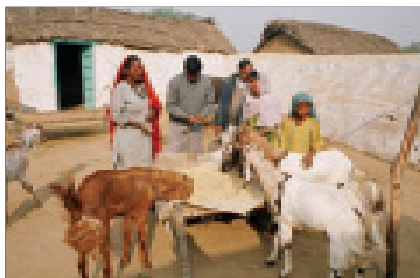
Sirohi Breed of Rajasthan